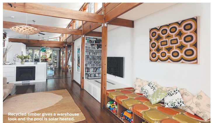
Recycled timber gives a warehouse look and the pool is solar heated.

skillion Colorbond roof has been fitted with photovoltaic solar panels, the pool is solar heated and fans were installed rather than airconditioning.